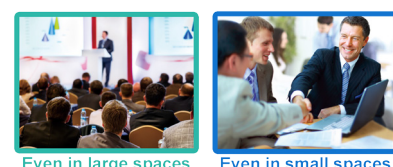
Even in large spaces