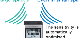
The sensitivity is automatically optimised